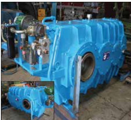
Fully refurbished, cleaned and coated.

Correctly refurbished to prevent costly breakdowns and plant shutdowns.